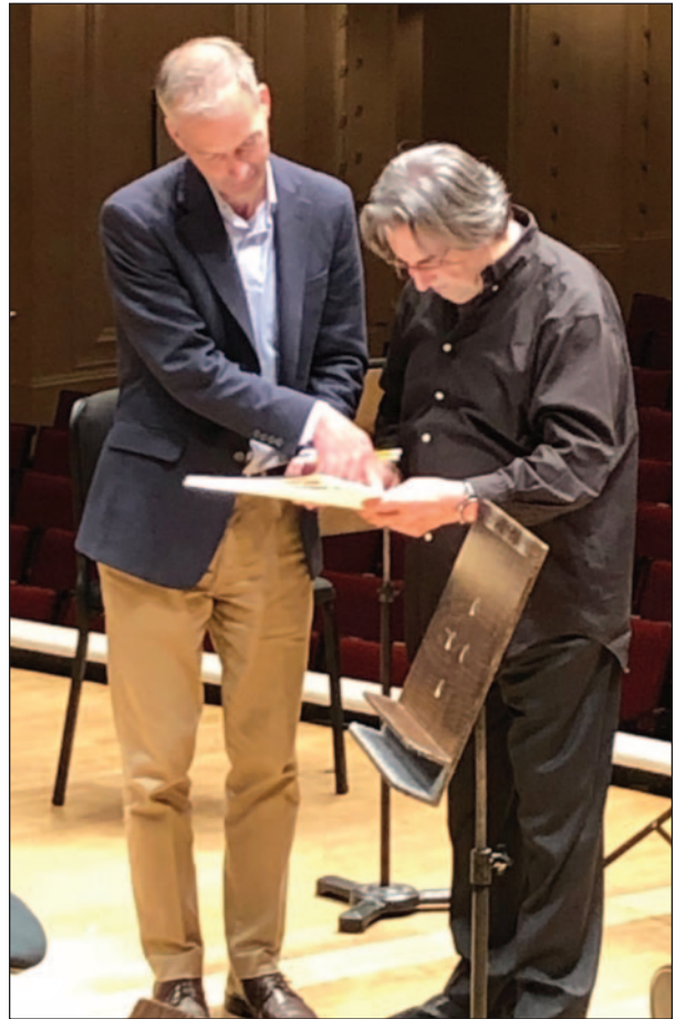
Chicago Symphony Orchestra Premiere with Riccardo Muti

In the summer of 2002, I set out to write a piece that explored different instruments and different families of instruments. It's funny and fast paced. Every 30 seconds, the music teaches kids something new, which helps to hold their attention. The cool part is that the musicians also really enjoy playing this piece. At the end, three or four kids on stage get to compose a new piece of music right there on the spot. That's why it's called Compose Yourself , an intentional pun. We present them with some melodies I wrote, harmonies that can go with any of those melodies, and some rhythms that work with any of those melodies or harmonies. It is a multiple choice tool that teaches how a piece of music is put together.